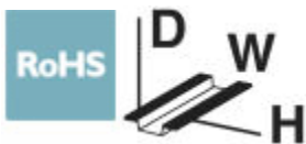
Figure shows PLC-BSC-120UC/21-21/SO46 version

14 mm PLC basic terminal block with spring-cage connection, without relay or solid-state relay, for mounting on DIN rail NS 35/7,5, 2 PDTs, input voltage 12 V DC