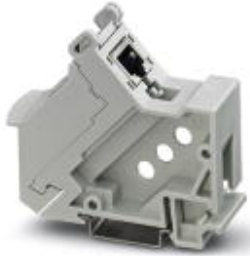
Patch panel, RJ45, DIN rail mounting, IP20, 1 slot, IDC connection, CAT6 A

Please be informed that the data shown in this PDF Document is generated from our Online Catalog. Please find the complete data in the user's documentation. Our General Terms of Use for Downloads are valid ( http://phoenixcontact.com/download )