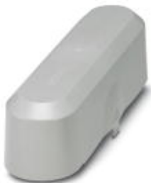
Cover, packed in pairs, length: 214 mm, width: 63 mm, height: 54.5 mm, color: gray

Please be informed that the data shown in this PDF Document is generated from our Online Catalog. Please find the complete data in the user's documentation. Our General Terms of Use for Downloads are valid ( http://phoenixcontact.com/download )