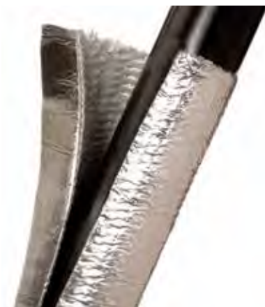
T6 is shipped in pre-cut 4' lengths