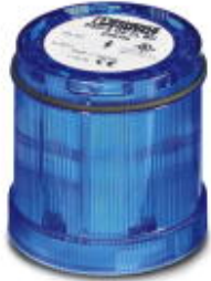
Flashing beacon element, 24 V DC, blue, Xenon flash tube

Please be informed that the data shown in this PDF Document is generated from our Online Catalog. Please find the complete data in the user's documentation. Our General Terms of Use for Downloads are valid ( http://phoenixcontact.com/download )